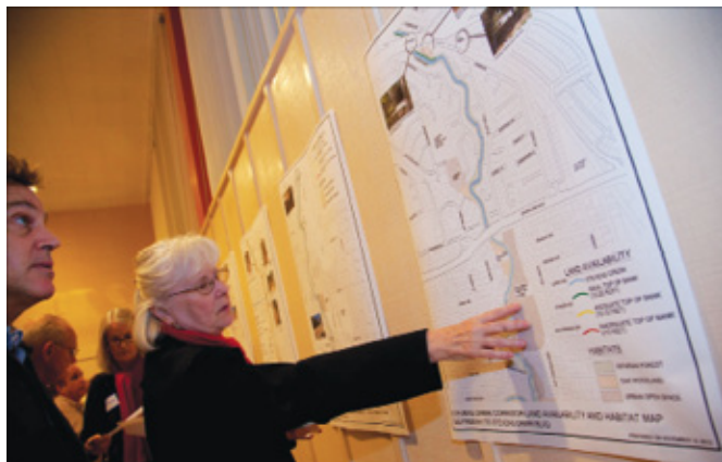
Local residents review maps of Stevens Creek Trail in November at the first of a series of public meetings scheduled to study completing the trail's missing segment between Sunnyvale and Cupertino.

Approximately two months after the first public meeting on the Stevens Creek Trail Joint Cities Feasibility Study, trail routes are taking shape.