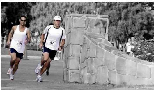
Trailblazer Race 2012

Every year we attract many volunteers wishing to give back to their community by participating in this event. Volunteer teams from nearby businesses, such as Synopsys and Google, are especially helpful. Hot food and cold drinks donated by local merchants always make the event especially enjoyable.