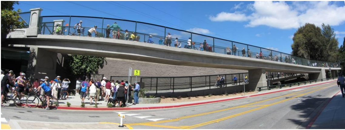
New Dale-Heatherstone ramp