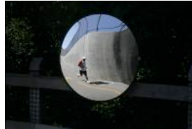
A jogger is reflected in a mirror as he runs on the Stevens Creek Trail in...